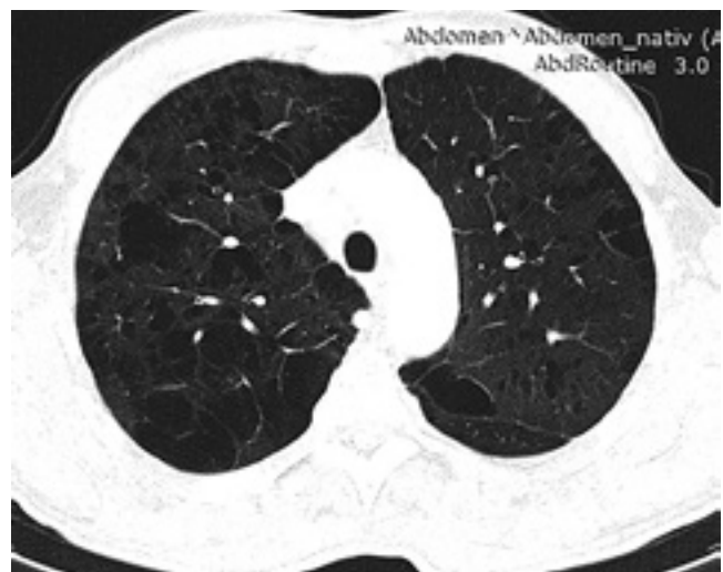
Figure 2. Thoracic CT scan (axial sections): paraseptal emphysema, “mosaic” images of emphysema (with normal and decreased attenuation), panlobular emphysema in right upper lobe (posterior).