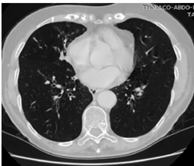
Figure 4. Thoracic CT scan (axial section). Diffuse emphysema. Bronchiectasis and bronchiolitis fenotype (image “tree-in-bud” right lower lobe, posterior)