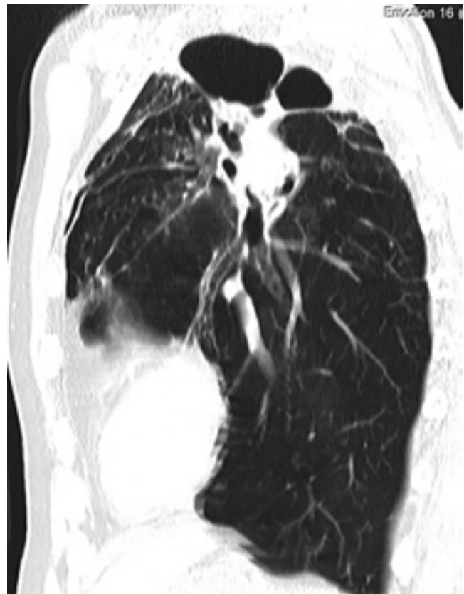
Figure 1. Thoracic CT scan (sagittal section). Diffuse emphysema, multiple apical bullae; bronchiectasis

Measurement of airway parameters correlates with the severity of airflow obstruction and with history of COPD exacerbation. Gas trapping was associated with