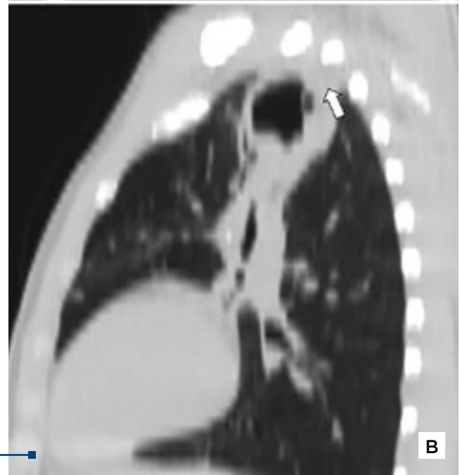
Figure 2. CT scan of the lungs. A, Axial Lung CT demonstrates a thick wall cavity in the left upper lobe containing a fluid level. B, Sagittal reformatted projection demonstrating pulmonary cavity contact with the posterior chest wall at the second intercostal space (white arrow)