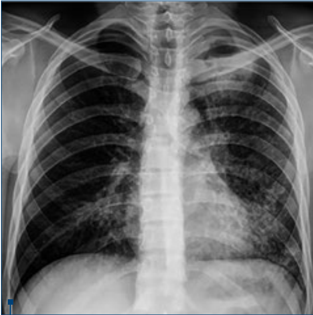
Figure 1. Initial chest x-ray with a diffuse left micronodular lung infiltrate and a left upper lobe cavity