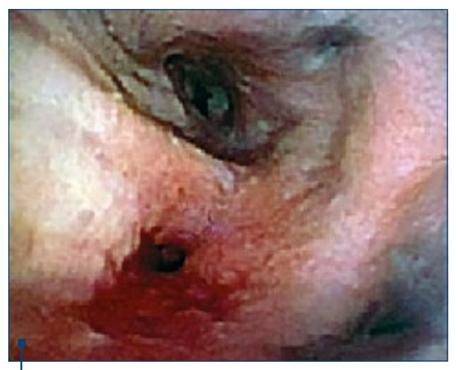
Figure 4 . Deformities, edema, stenosis and scar in the right main bronchus and right airways