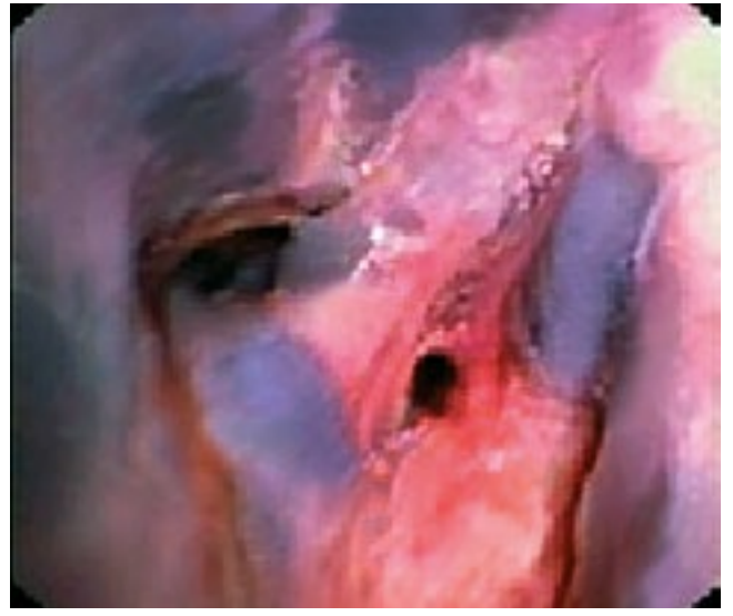
Figure 2. Diffuse black anthracosis with stenosis , deformities and inflammation in the right upper lobe lumen