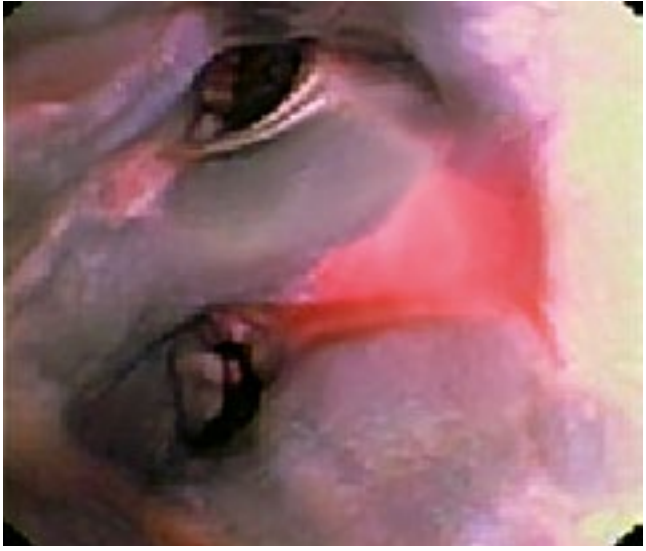
Figure 3. Diffuse anthracotic bronchitis with inflammation, oedema and stenosis in the Left upper, lingual and left lower lobe