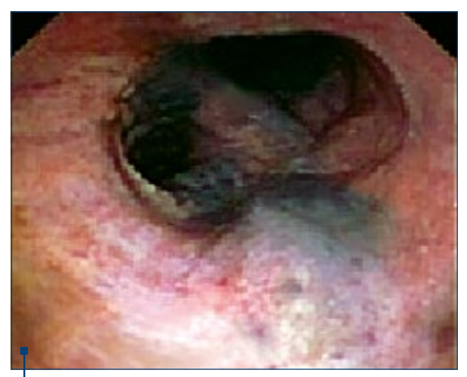
Figure 5. Black pigmentation in Left main bronchus and orifices of the Left upper and lower lobes

subjects. Arch Iran Med 2012 Mar;15(3):128-30.