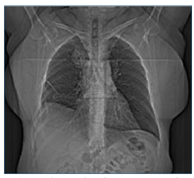
Figure 1: Pulmonary radiography in posteroanterior incidence

Arterial blood gas analysis: pH=7.37, Pco2=37 mmHg, Po2=81 mmHg.